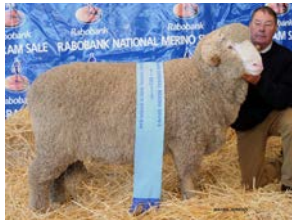
Great Grand Sire W100019

This success follows the NSW Hogget Ram title that PB150026 won last year with PB140948 and PB130037 winning the Riverina Wool Australian Hogget Ram title in the prior two years.