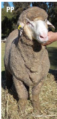
PB160445 x PB140948 FD 17.4 SD 2.5 CV 14.4 CF 99.7