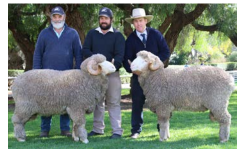
Top priced Wanganella Ram W151992 purchased in conjunction by Bunyara Merino Stud, Moculta and North Cowie Merino Stud, Warooka for $22,000.