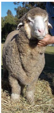
PB160126 x PB120020 FD 18.6 SD 2.6 CV14.0 CF 99.9