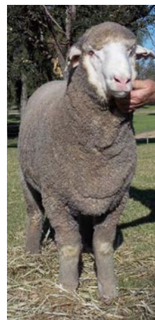
PB161080 x PB220 Syn FD 18.2 SD 2.5 CV 13.7 CF 99.9