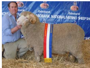
Grand Sire W120001