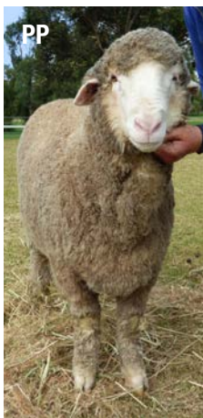
PB160249 x PB140108 FD 17.6 SD 2.4 CV 13.6 CF 100.0

Poll Boonoke will again be offering a pen of 5 sale rams at the Hamilton Sheepvention Auction on Tuesday 8 August 2017. The Sale Team will be on display at the 2017 Australian Sheep & Wool Show or contact Angus Munro for a pre auction inspection.