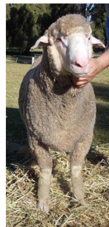
PB161716 x PB Gen FD 19.0 SD 2.5 CV 13.2 CF 99.7